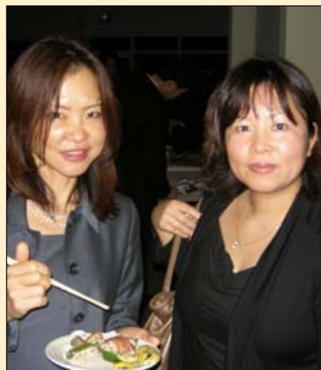
Enjoying great food and networking