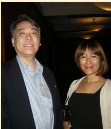
Keizai's IT manager makes a new contact.