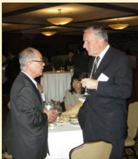
After the ceremony Ambassador Armacost was available for personal dialogue.