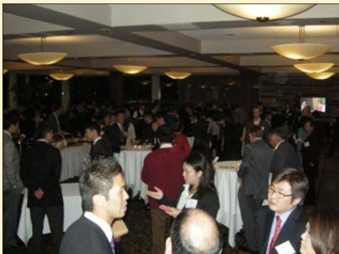
Shinnenkai attendees took advantage of networking opportunities.