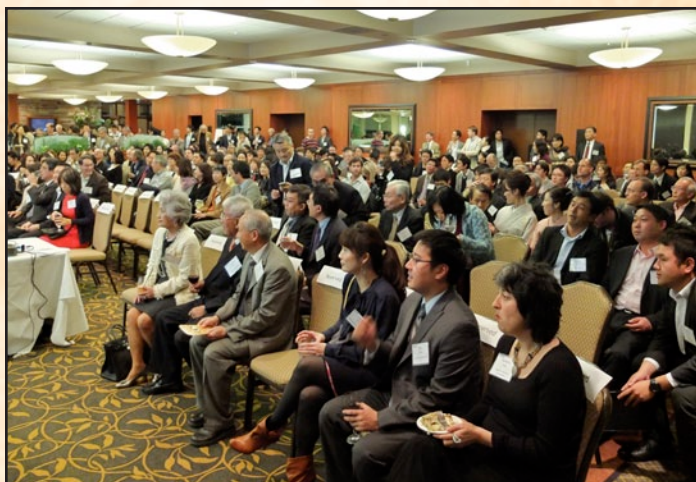
Keizai Society's 22nd Anniversary and 2012 Shinnenkai Guests at the Palo Alto Hills Golf and Country Club.