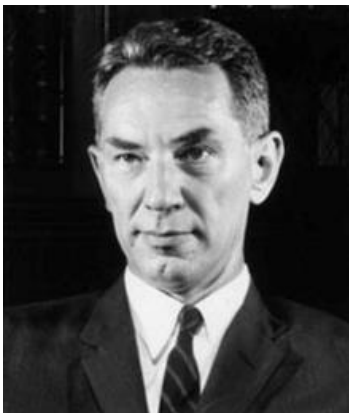
Dr. Edwin O. Reischauer

In the post-war era, the first outstanding and memorable ambassador