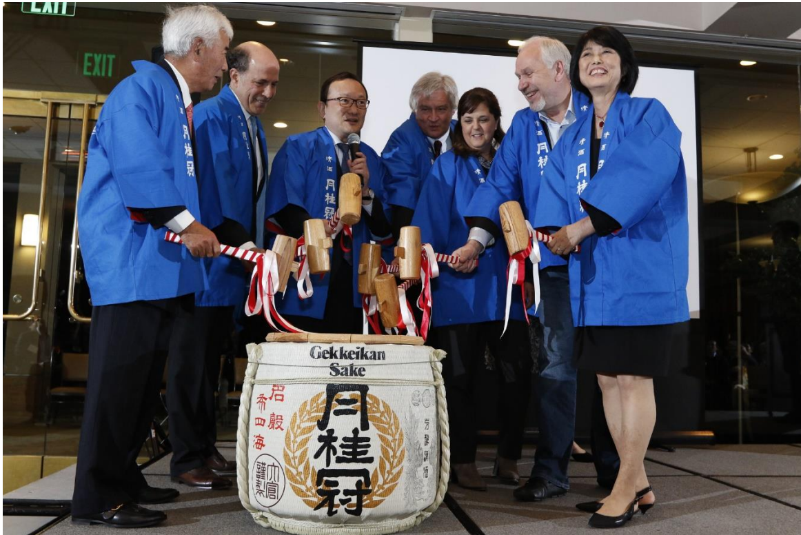
The Traditional Kagamiwari