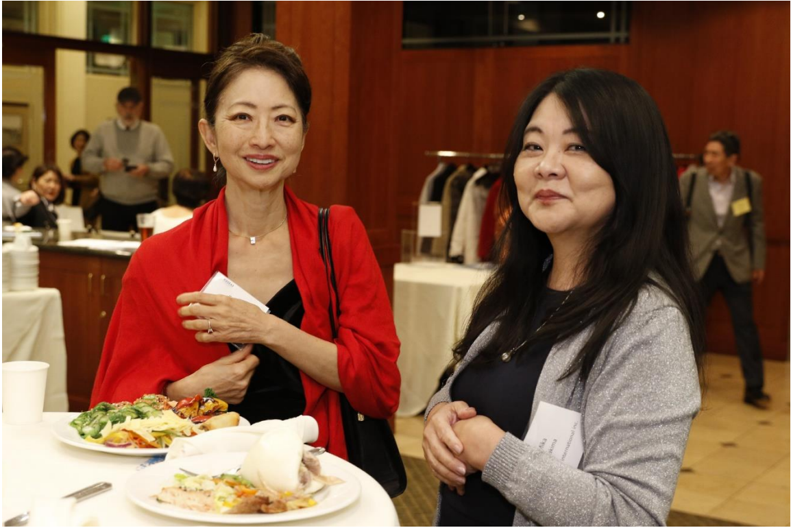
Enjoying Food And Conversation