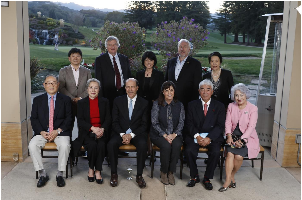
Our Honored Guests