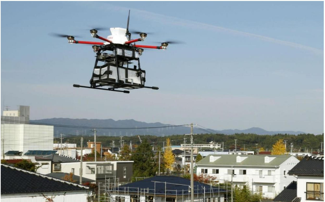
Japan Post Delivery Drone

On Thursday, March 21st, Keizai Silicon Valley will host an exciting forum on the current uses and future trends of drones. The Japanese post office is already ahead of its US counterpart in exploring the possibilities of drone delivery. While the efforts of the United States Postal Service so far have amounted only to some customer surveys, Japan Post is moving ahead with pilot programs to test actual drone deliveries. Last November Japan Post began transporting certain documents between post offices in Fukushima Prefecture. The use of postal drones could be particularly effective in rural areas of Japan, especially with the current labor shortages seen in those areas. In order to operate drones out of sight of the operator, Japan Post was required to equip the drones with remotely monitored cameras. Japan Post states that they will limit initial use of the drones to deliveries between post offices.