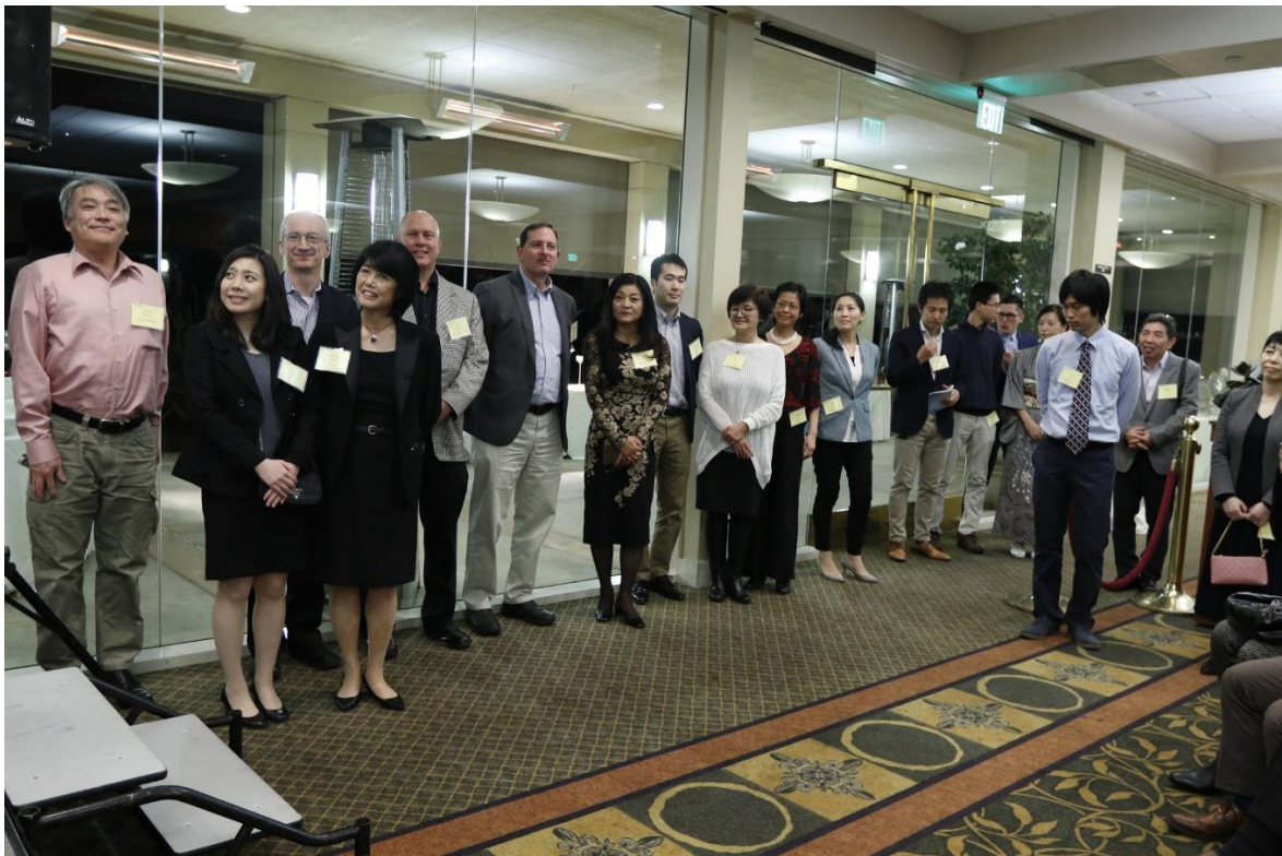
The Keizai Silicon Valley Volunteer Staff