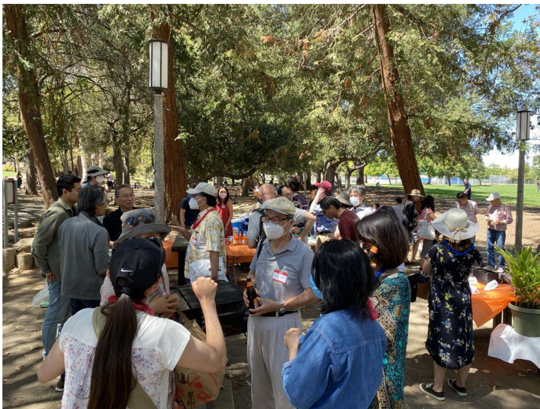
Plenty of time for networking