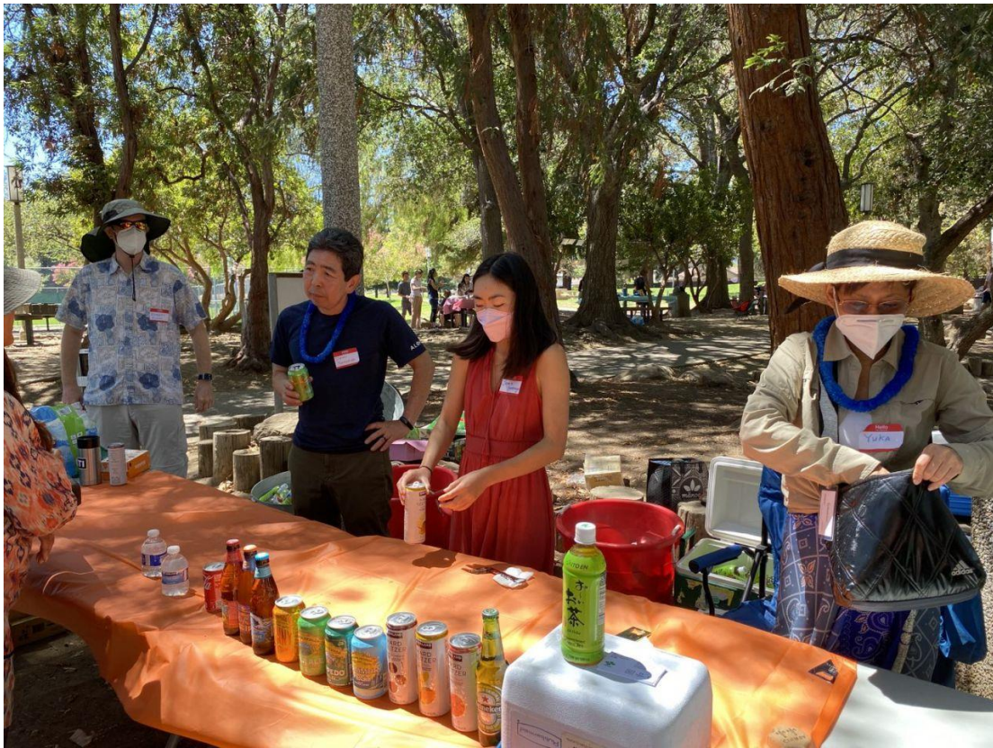
We have drinks for you!