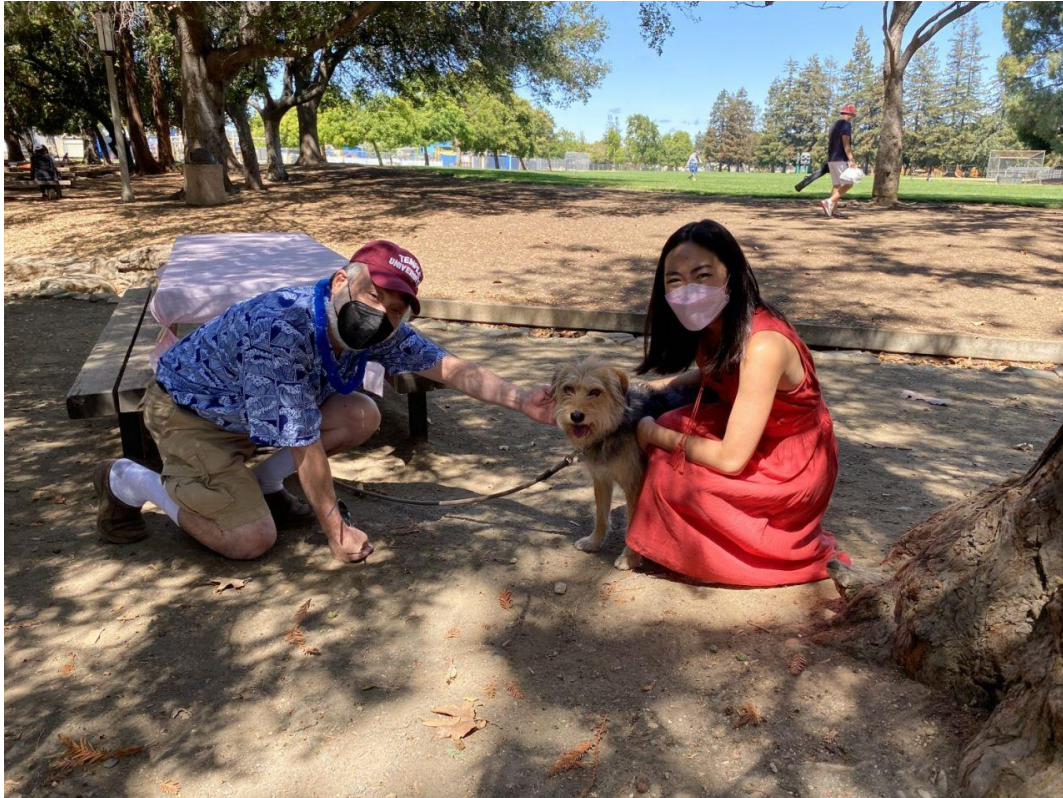
Dogs are welcome too!