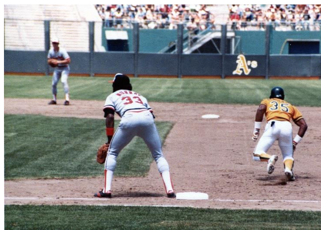
Rickey Henderson steals a base in 1983

In 1980, Finley sold the team to Walter A. Haas, Jr of the well-known Haas family of San Francisco (Levi Strauss & Co, the Haas-Lilienthal House museum, etc). Haas pulled together players Jose Canseco, Mark McGwire, and Rickey Henderson to create a team that won the cross-bay World Series against the Giants in 1989, Game 3 of which was famously interrupted by the Loma Prieta earthquake. In the early 2000's, the A's had many winning teams, partially driven by General Manager Billy Beane's statistical analysis (called sabermetrics) that was made famous in the book and film Moneyball , starring Brad Pitt. Now there is talk of the Athletics either building a new stadium in Oakland or perhaps moving to Las Vegas. If the next period of Athletics history is anything like the past, I am sure it will be colorful.