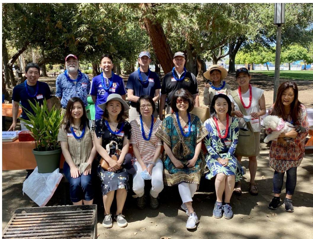
Your Keizai all-volunteer staff