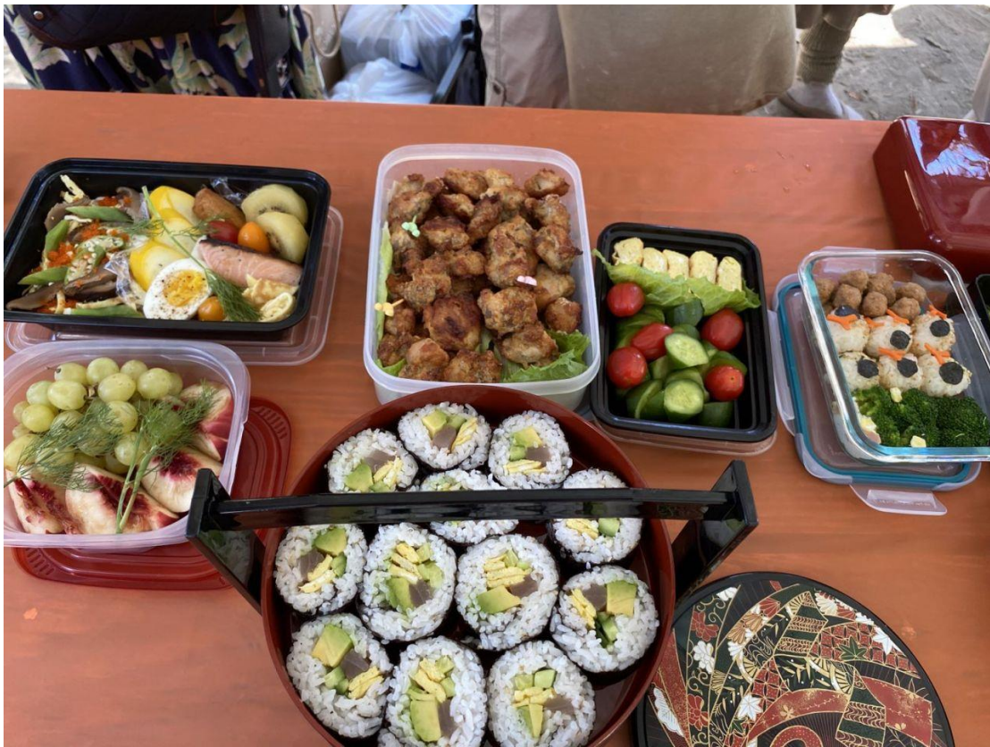
Many beautiful and delicious bentos