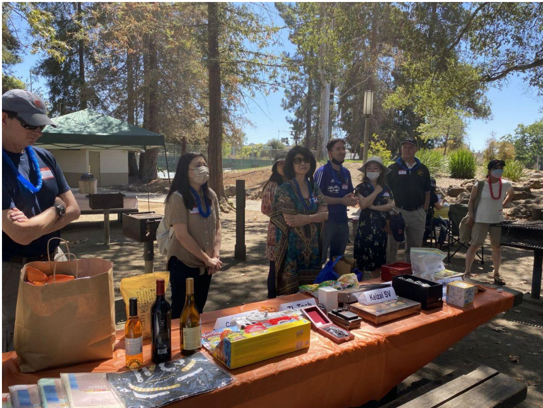
And many great prizes to be won