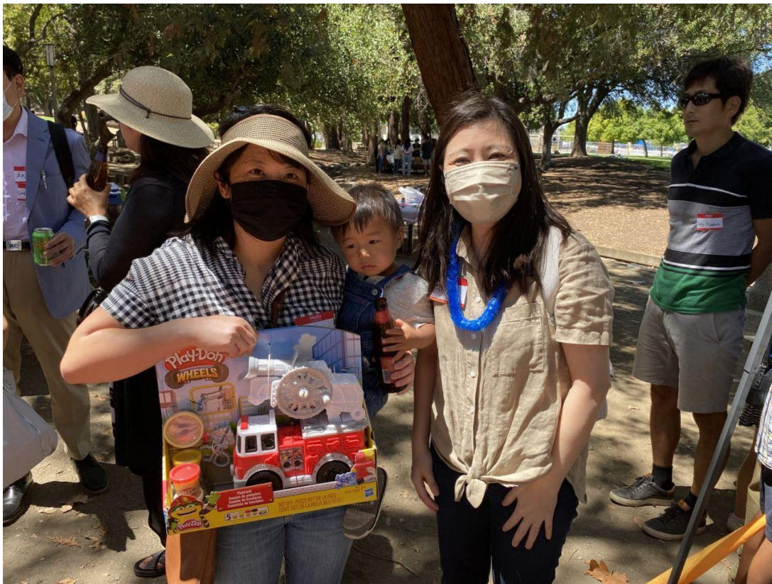
Can't wait to play with this