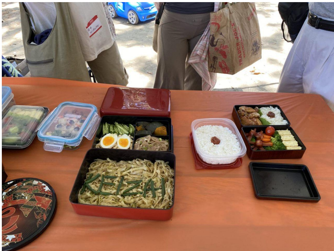
The Bento Competition starts