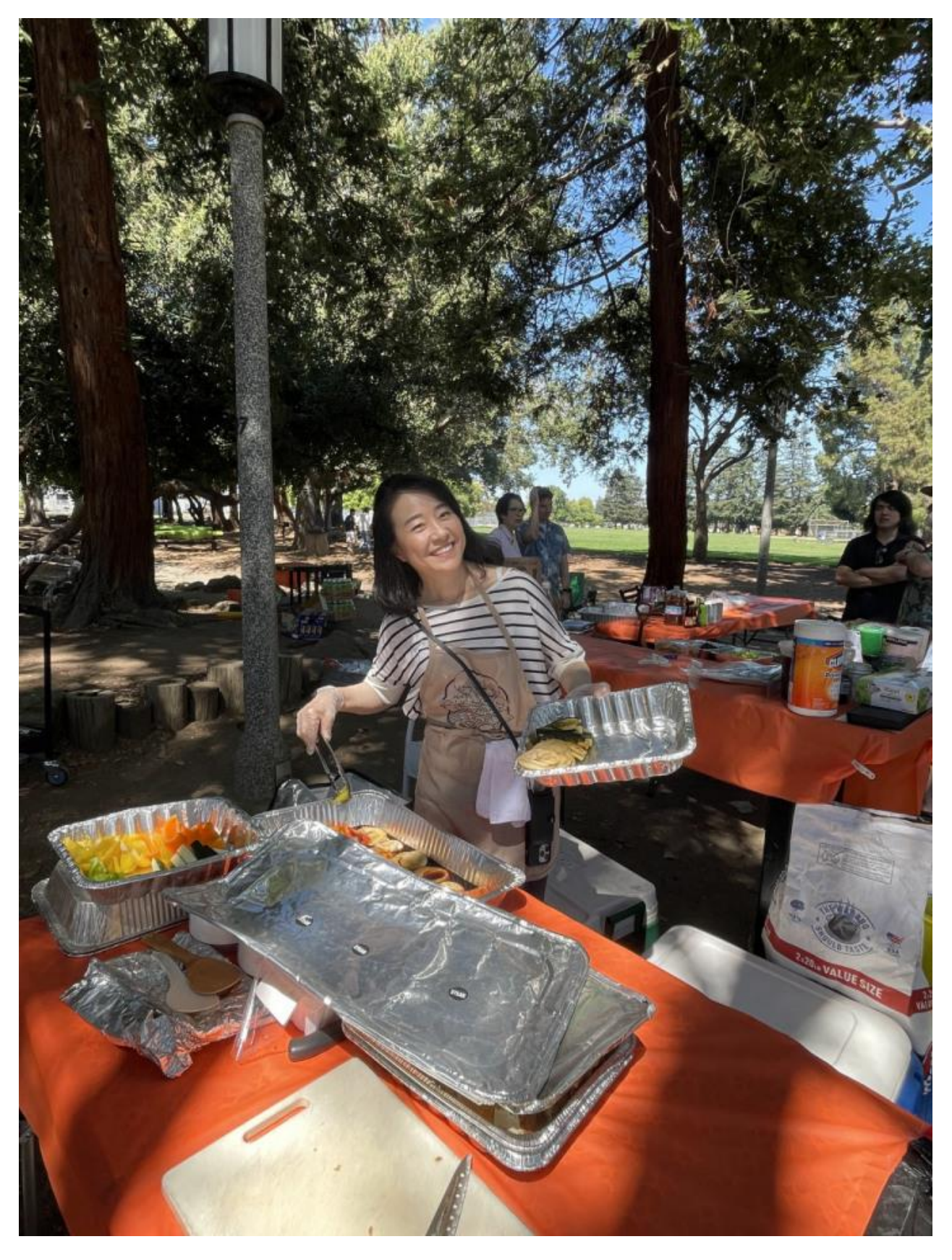
Serving up the food