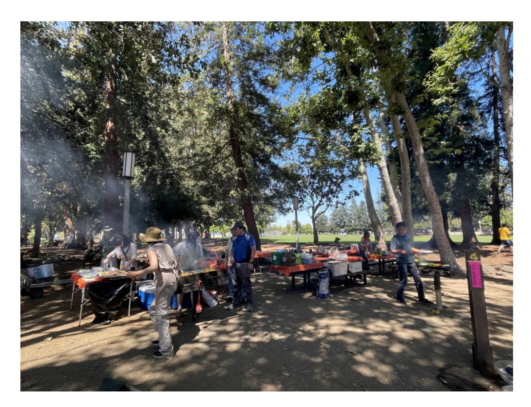
Grilling up a storm