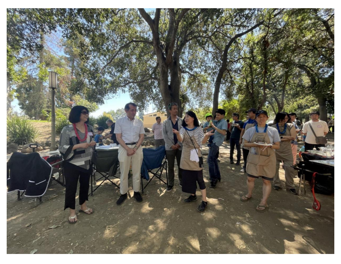
Speaking to the crowd