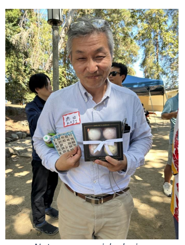
Not everyone picked wine