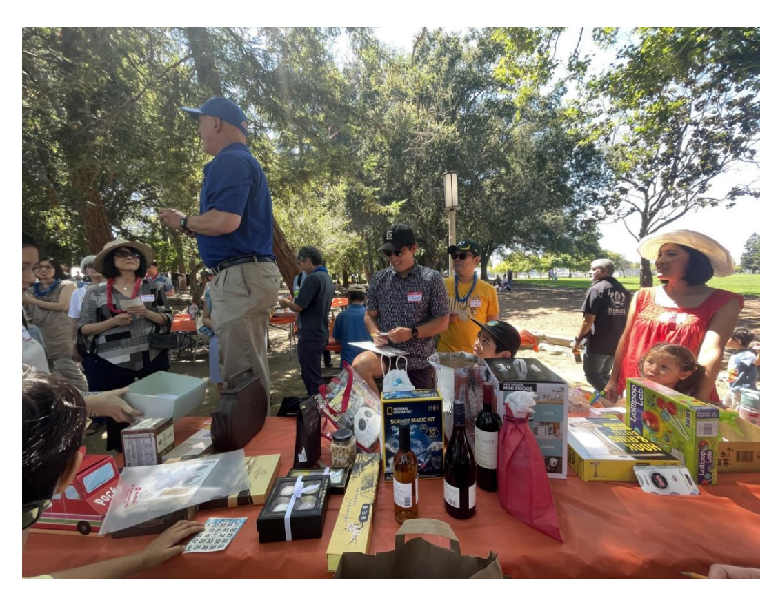
Lots of Bingo prizes