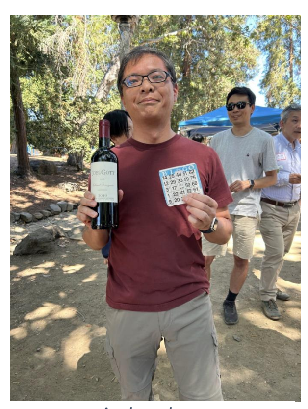
A wine winner