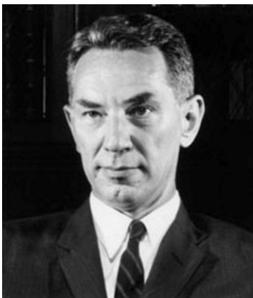
Edwin O. Reischauer

Finally, there is Beate Sirota Gordon, who was one of the few women on Douglas MacArthur's occupation staff. Beate Sirota was born in Austria and emigrated with her family to Japan in 1929, when her father took a position at the Imperial Academy of Music (now Tokyo University of the Arts). Beate became fluent in Japanese during her ten years in Japan, and after the war she joined MacArthur's staff as a translator, eventually