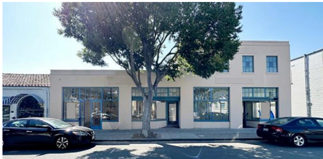
Japan Innovation Campus

On Tuesday, August 27th, Keizai Silicon Valley joined with SACC (Swedish American Chamber of Commerce), GABA (German American Business Association), and CSPA (California Software Professional Association) to host a refreshingly innovative event focused on achieving balance and